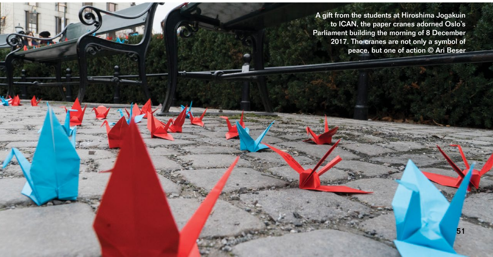
A gift from the students at Hiroshima Jogakuin to ICAN, the paper cranes adorned Oslo's Parliament building the morning of 8 December 2017. The cranes are not only a symbol of peace, but one of action

As of early 2021, France possessed a stockpile of an estimated 290 nuclear warheads. Approximately 200 of these warheads are deployed or operationally available for deployment on short notice. This includes up to 240 warheads for three deployable submarines and up to 50 cruise missiles for land – and sea-based aircraft. The third submarine might take longer to ready and the cruise missiles for the Charles De Gaulle aircraft carrier are stored on land under normal circumstances.