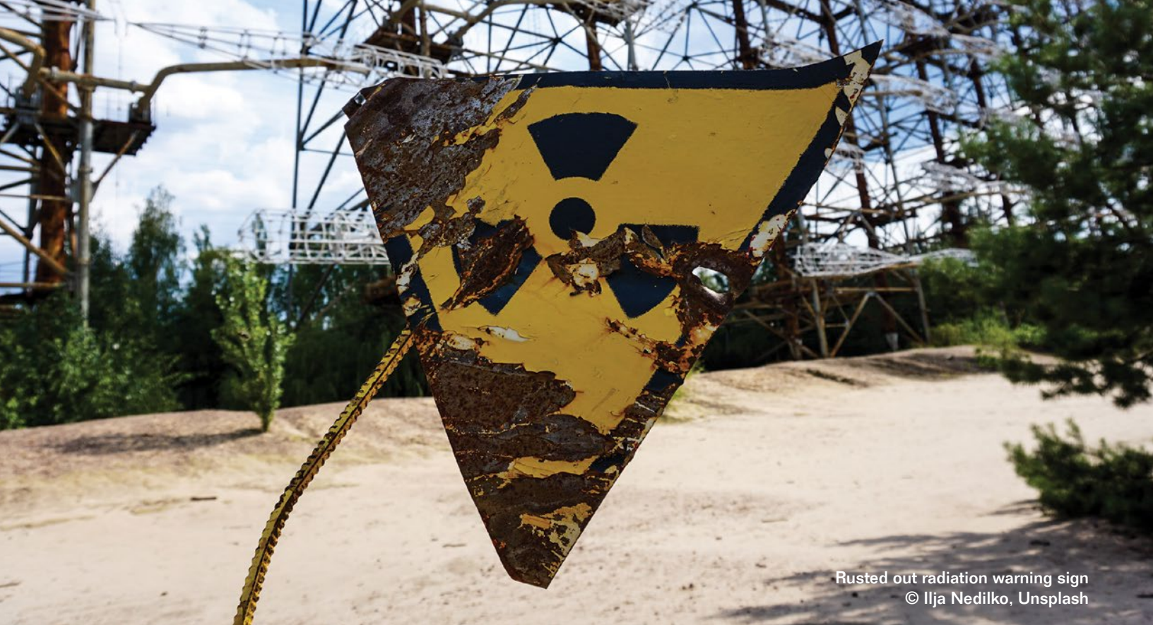
Rusted out radiation warning sign

present would not support an arsenal of more than 1,000 warheads. 9 By comparison, the US and Russia each possess a total over 6,000 warheads.