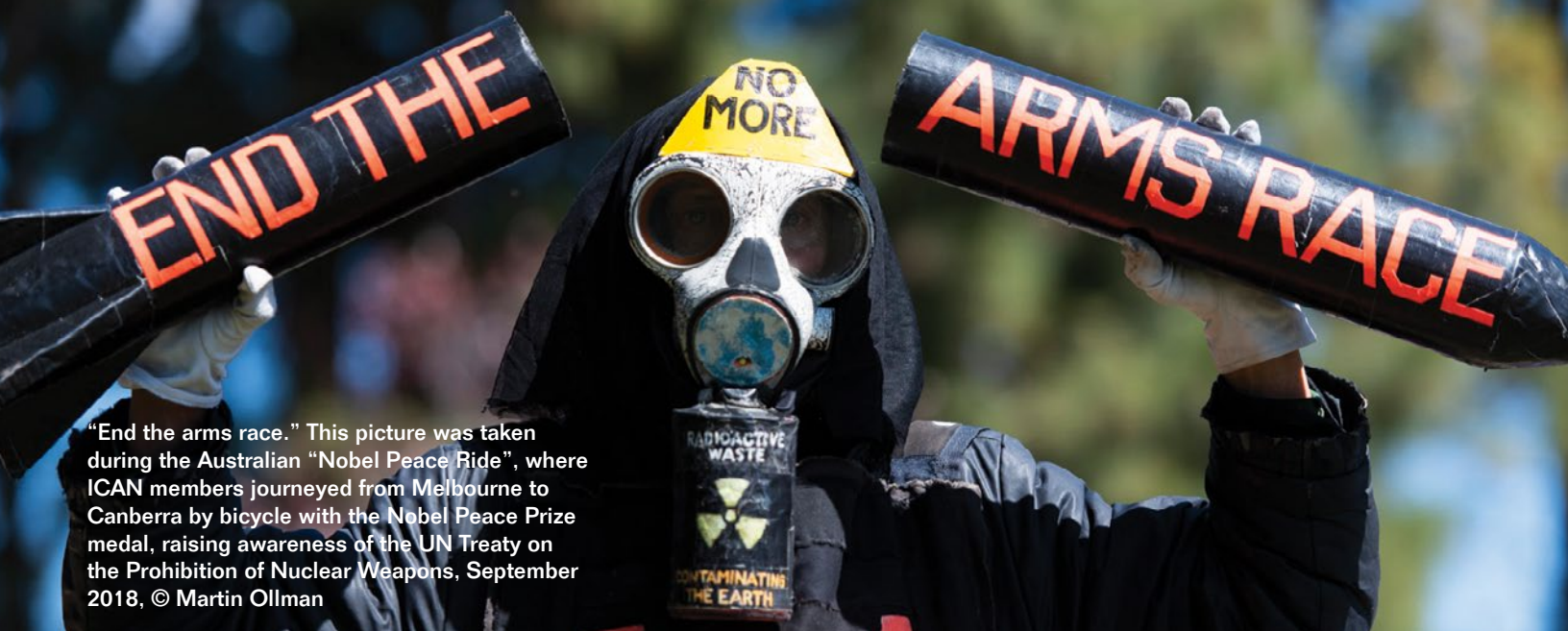
"End the arms race." This picture was taken during the Australian "Nobel Peace Ride", where ICAN members journeyed from Melbourne to Canberra by bicycle with the Nobel Peace Prize medal, raising awareness of the UN Treaty on the Prohibition of Nuclear Weapons, September 2018